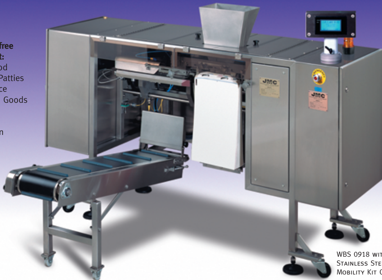
WBS 0918 WITH STAINLESS STEEL & MOBILITY KIT OPTIONS

Automatic Wicketed Bagger designed to bag and seal a wide variety of product in various sizes and types of both poly and laminated pre-made bags.